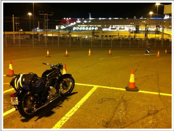
At the harbor

Warm and dry clothes the next morning, no rain, clear skies. Very convenient riding for 50km, then the rain set on again. At least there was no fog. But home felt close now, another stop at a filling station where I indulged in the ultimate luxury - changing into a spare set of dry clothes. It